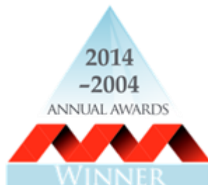
M&A Advisor Awards

FT Partners has been recognized as Investment Banking Firm of the Year and regularly achieves Merger and Financing Deal of the Year recognition