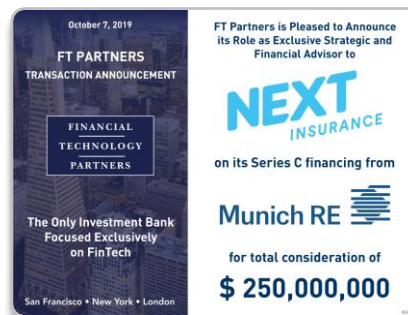
Next Insurance's $250 million Series C Financing