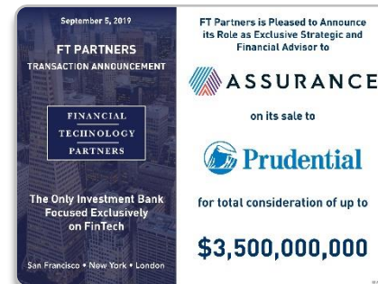
Assurance's $3.5 billion Sale to Prudential