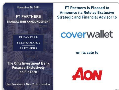
CoverWallet's Sale to Aon