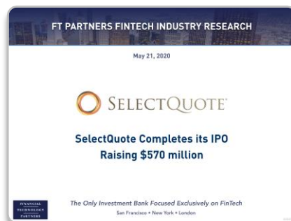
SelectQuote Completes its IPO Raising $570 million