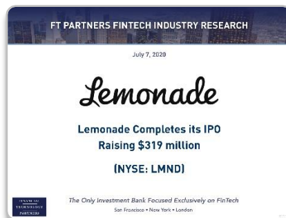
Lemonade Completes its IPO Raising $319 million