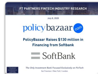
PolicyBazaar Raises $130 million in Financing