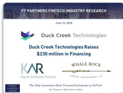
Duck Creek Technologies Raises $230 million in Financing