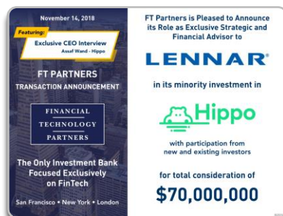
Lennar's $70 million Co-Lead Investment in Hippo