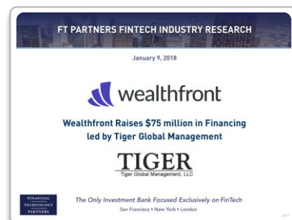
Wealthfront Raises $75 million in Financing