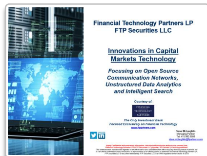
Research Report: Innovations in Capital Markets Technology