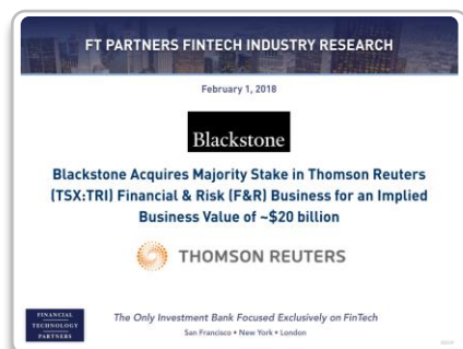
Blackstone Acquires Majority Stake in Thomson Reuters Financial & Risk Business