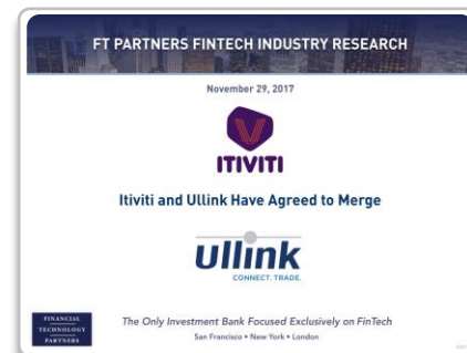
Itiviti Acquires Ullink