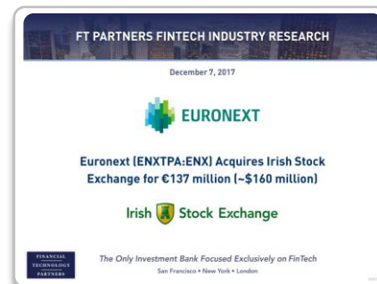
Euronext Acquires Irish Stock Exchange for $160 million