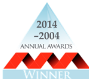
M&A Advisor Awards

FT Partners has been recognized as Investment Banking Firm of the Year and regularly achieves Merger and Financing Deal of the Year recognition