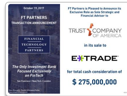
TCA's $275 million sale to E*TRADE