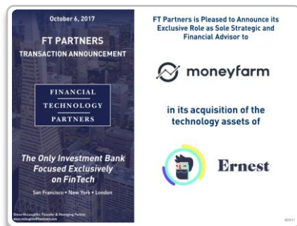
Moneyfarm Acquires the Technology Assets of Ernest