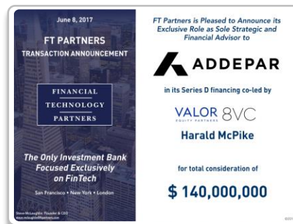
Addepar's $140 million Series D Financing