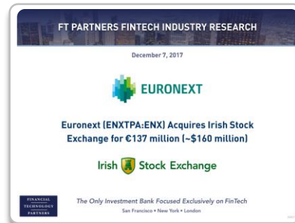
Euronext Acquires Irish Stock Exchange for $160 million