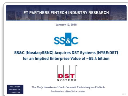
SS&C Acquires DST Systems for an Implied Enterprise Value of $5.4 billion