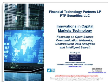
Research Report: Innovations in Capital Markets Technology