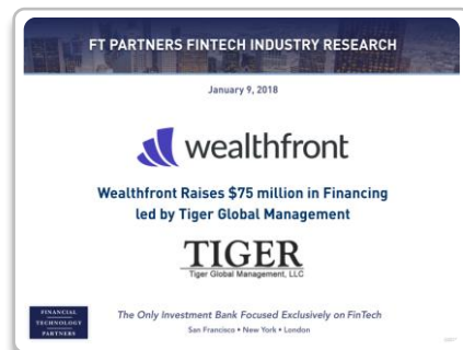
Wealthfront Raises $75 million in Financing