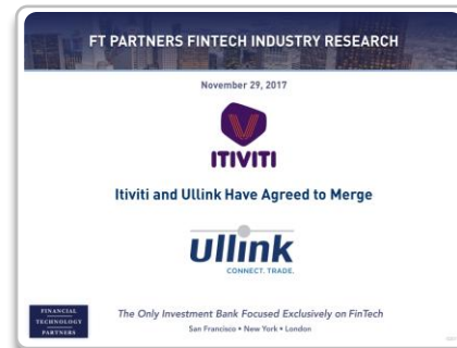
Itiviti Acquires Ullink