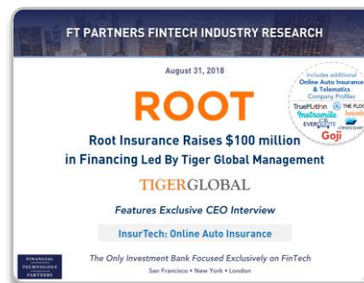
Root Insurance Raises $100 million in Financing