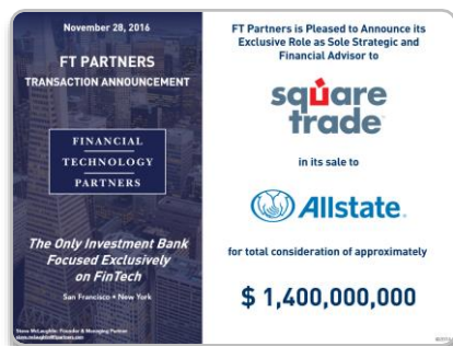
SquareTrade's $1.4 billion Sale to Allstate