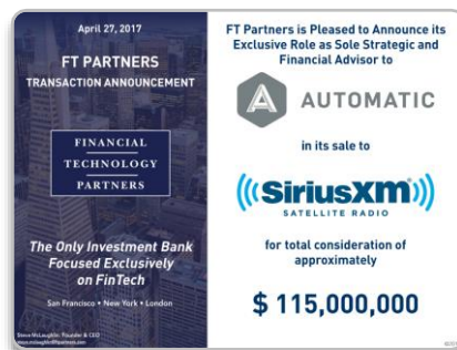
Automatic's $115 million Sale to SiriusXM