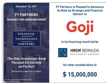
Goji's $15 million Financing Round Led by HSCM Bermuda