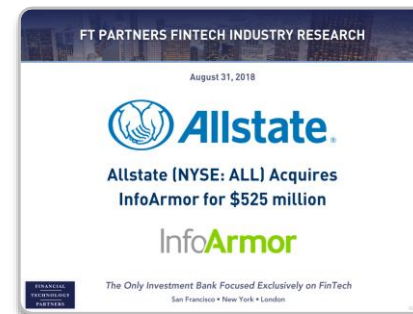
Allstate Acquires InfoArmor $525 million