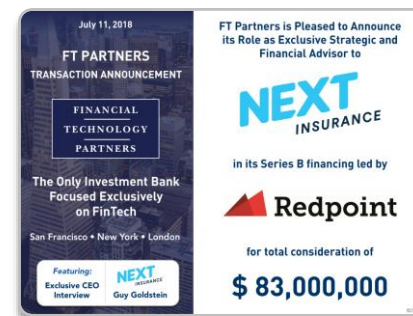
Next Insurance's $83 million Series B Financing