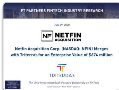
Netfin Acquisition Corp. Merges with Triterras for an Enterprise Value of $674 million