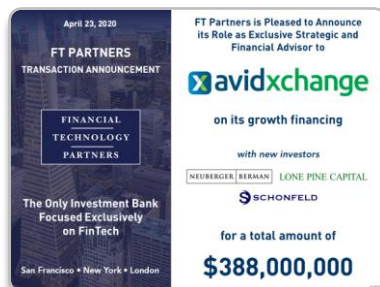
AvidXchange's $388 million Financing