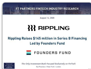
Rippling Raises $145 million in Series B Financing