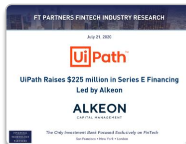
UiPath Raises $225 million in Series E Financing