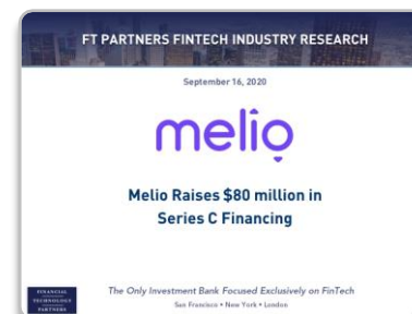
Melio Raises $80 million in Series C Financing