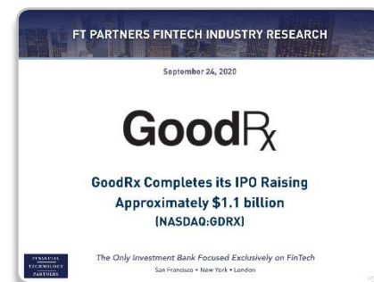
GoodRx Raises $1.1 billion in its IPO