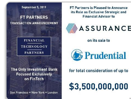
Assurance's $3.5 billion Sale to Prudential