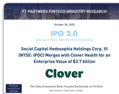
Clover Health Merges with Social Capital Hedosophia Holdings Corp. III