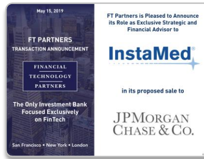
InstaMed's Sale to JPMorgan Chase