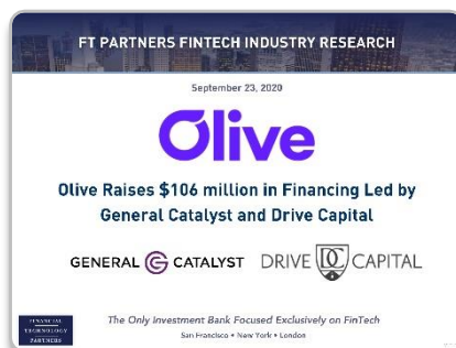
Olive Raises $106 million in Financing