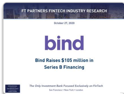
Bind Raises $105 million in Series B Financing