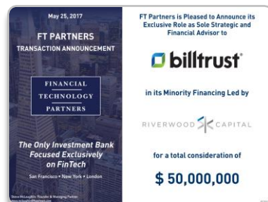
Billtrust's $50 million Minority Financing