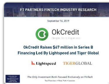
OkCredit Raises $67 million in Series B Financing