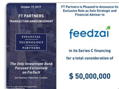
Feedzai's Series C Financing