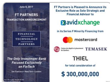
AvidXchange's $300 million Series F Financing Led by Mastercard