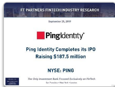
Ping Identity Raises $188 mm in its IPO