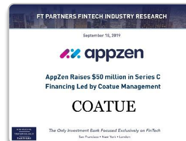
AppZen Raises $50 million in Series C Financing