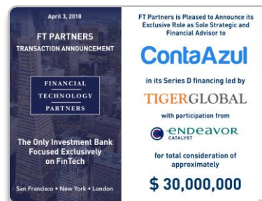
ContaAzul's $30 million Series D Financing