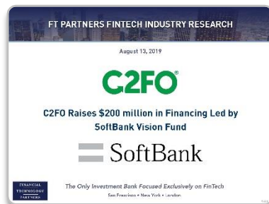
C2FO Raises $200 million in Financing