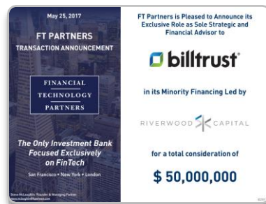
Billtrust's $50 million Minority Financing