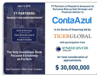
ContaAzul's $30 million Series D Financing