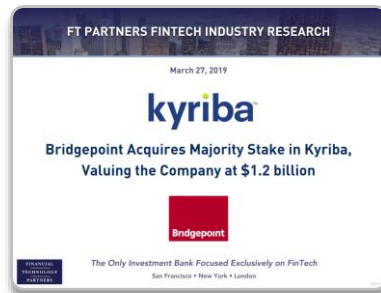
Bridgepoint Acquires Majority Stake in Kyriba