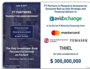
AvidXchange's $300 million Series F Financing Led by Mastercard