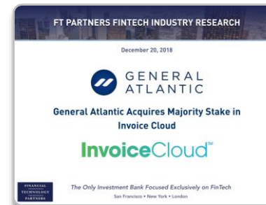
General Atlantic Acquires Majority Stake in Invoice Cloud