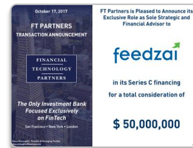
Feedzai's Series C Financing