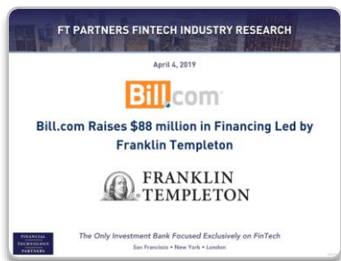
Bill.com Raises $88 million in Financing