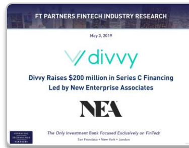
Divvy Raises $200 million in Series C Financing