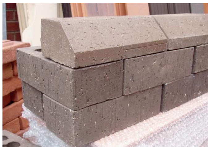
Due to different extrusion processes, the drag wire marks on the plinth bricks run horizontal whilst the standard bricks are vertical.

A popular use of special shapes is to specify a different colour or texture to the main brickwork. This shows off the shapes to their fullest and makes an attractive feature.