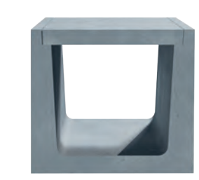
We have a full range of compatible precast concrete, steel tray and GRP (Glass Reinforced Polymer) composite lids.