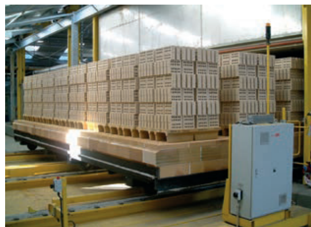
Kiln car exiting a tunnel kiln.

Different firing schedules are necessary for different clay types. This is not just a matter of peak temperature. To maximise production it is clearly necessary to arrange for long production runs and as few changes as possible in order to achieve best results.