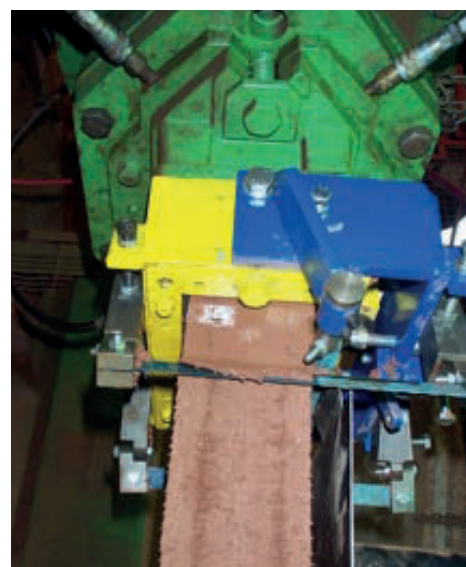
Column of extruded clay undergoing a rusticated texture.

These variations may affect the brick making process and the properties of the finished product.