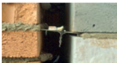
Wall tie incorrectly sloping toward inner leaf.

Wall ties are sandwiched within the mortar joints of each leaf and span the cavity to tie the structure together. Without these the walls may buckle in strong wind. If they are placed sloping downwards toward the inner leaf, water passing through the brickwork may travel down them causing damp spots on the inner wall.