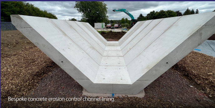
Bespoke concrete erosion control channel lining.