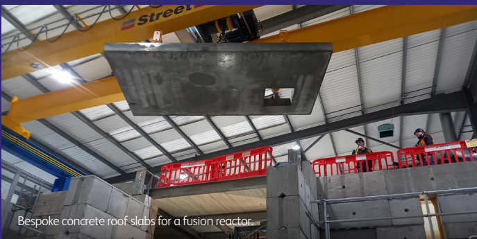
Bespoke concrete roof slabs for a fusion reactor.