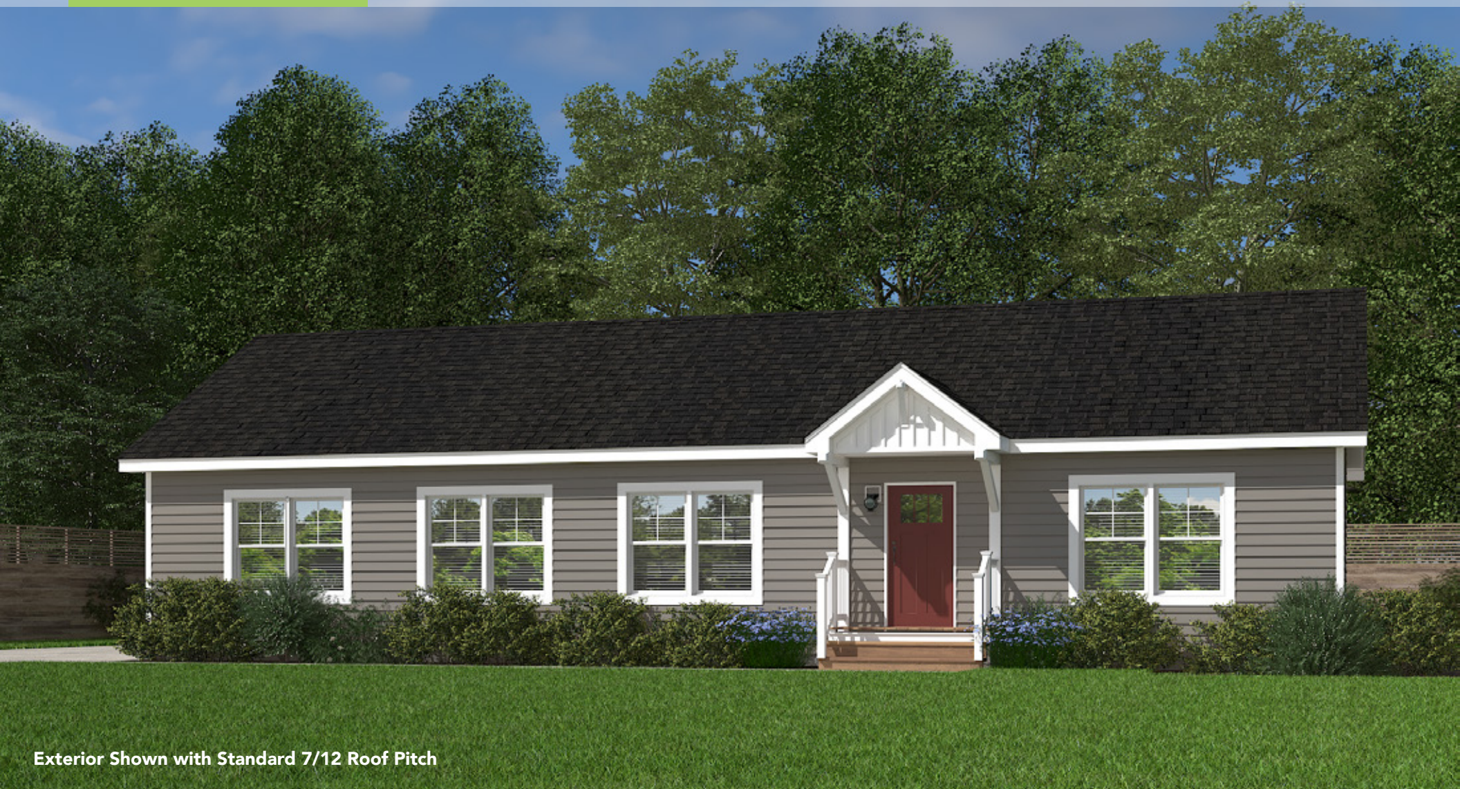
Exterior Shown with Standard 7/12 Roof Pitch

These are artist renditions for sales purposes only. Refer to working drawings for actual dimensions. © January 2022 Nationwide Homes, Inc. All Rights Reserved.