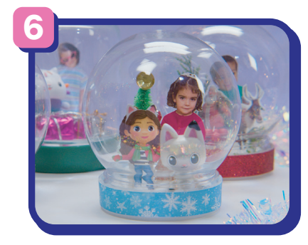
Place your snow globe somewhere special!

Add cotton balls as a layer of fake snow and other decorations.