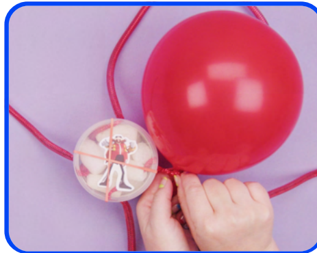
In foam peanuts with balloons