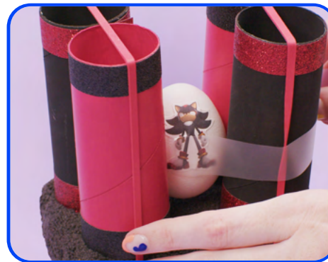
Sitting on fabric with paper tubes