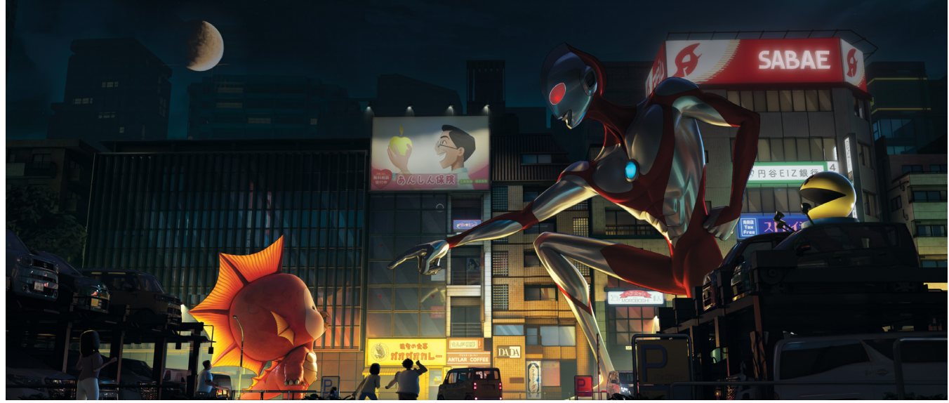
Answers: 1. Moon, 2. Man holding apple, not baby, 4. Red eye, 5. Missing people, 5. Text on red billboard