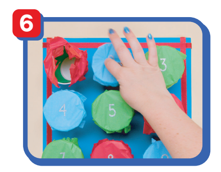
Enjoy the Countdown!