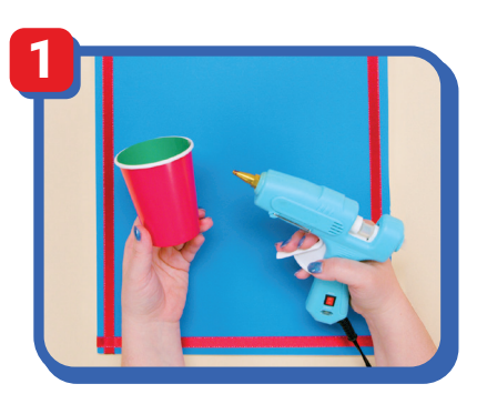
Start with the base Place a blue board on a table.