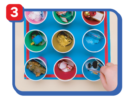
Fill the Cups Add toys & treats inspired by your favorite Netflix Holiday titles.