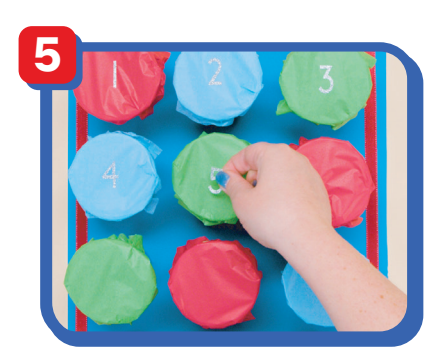
Number the Rolls Use number stickers to label each cup from 1 to 12.