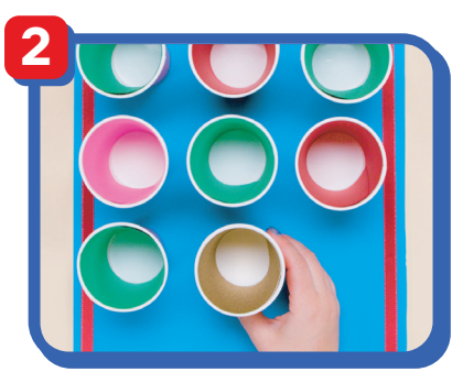
Arrange the Cups Place twelve cups in three rows of four. Glue or tape the cups to the blue board.