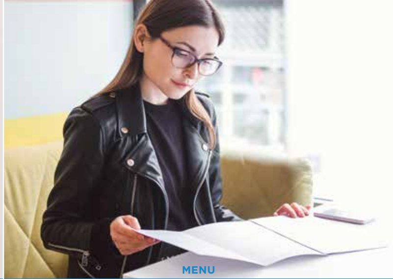
MENU YUPOBLUE YPI 250