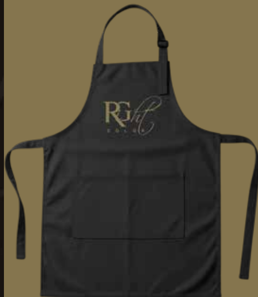
Right Color APRON