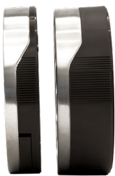
Satin Chrome Keypads