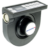
Keypad Up KU