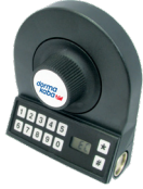
Keypad Down KD