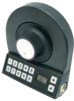
Keypad Down KD