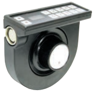
Keypad Up KU