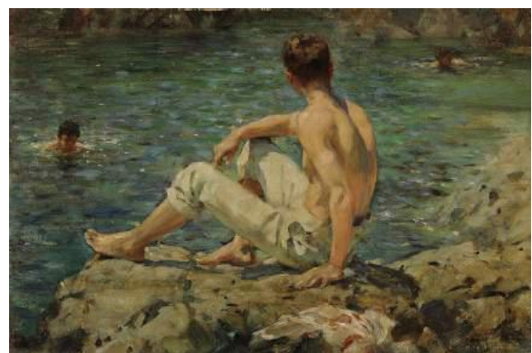
Henry Scott Tuke - Green and Gold, 1920

Viridian is a versatile green, chromatic enough for landscape yet subtle enough for figurative work. Utrecht Viridian is a single-pigment color made with genuine Hydrated Chromic Oxide- not phthalo hue mixtures as in some other brands.