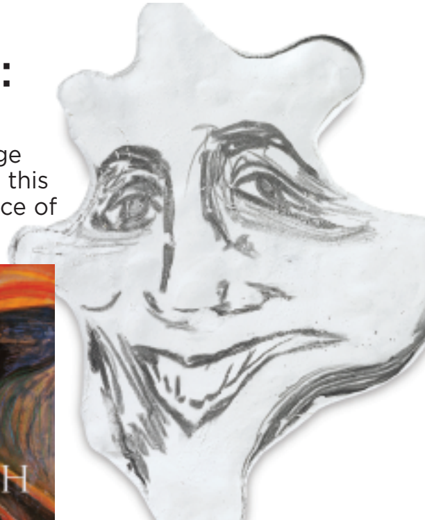
above: monoprint portrait with distortion applied, created from photocopied image, below.