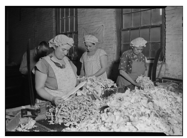
The best watercolor paper is made of rag fiber. This means cotton and/or linen (today it's mostly cotton). The term "rag" is derived from the original source of Western paper fiber: old cloth rags.

Some painters avoid animal products, and prefer not to use papers sized with gelatin. Even synthetic sizings (like AKD, for example) may not be entirely animal-free, however, since fatty acids used in production may or may not be from animal sources. Artists who prefer not to use animal-derived art materials can select papers sized with animal-free starch sizing.