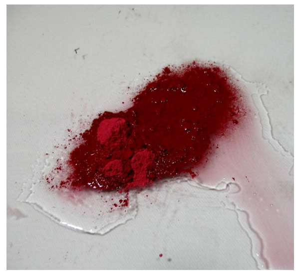
Pigment moistened with denatured alcohol

then be stored in tightly capped jars and combined with the binder as needed.