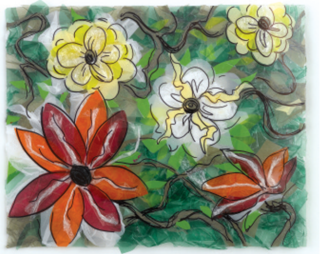
Front side view

Copyright © 2009 Dick Blick Art Materials. All rights reserved. JD