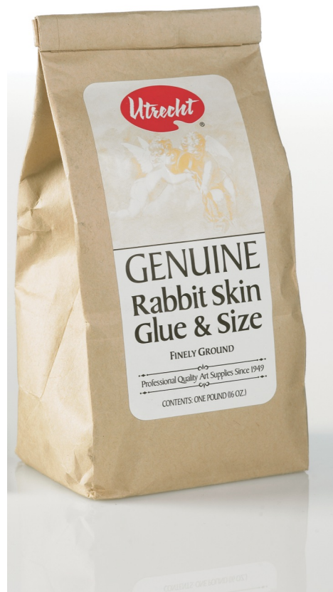
Rabbit Skin Glue

A flat, dimensionally stable surface helps promote durability in paintings on canvas. By providing rigidity, sizing ensures that even if the canvas loses peak tension, it remains reasonably flat and does not change dimension enough to compromise the bond between sizing, priming and paint.