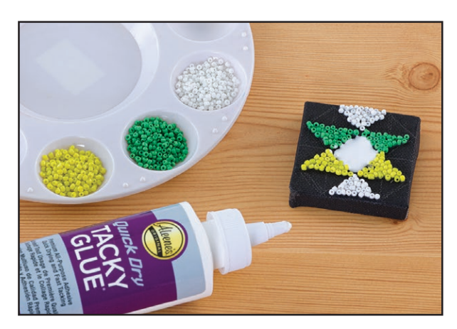
Step 2: Fill a section of the design with glue, and add colorful seed beads. Repeat until design is complete.