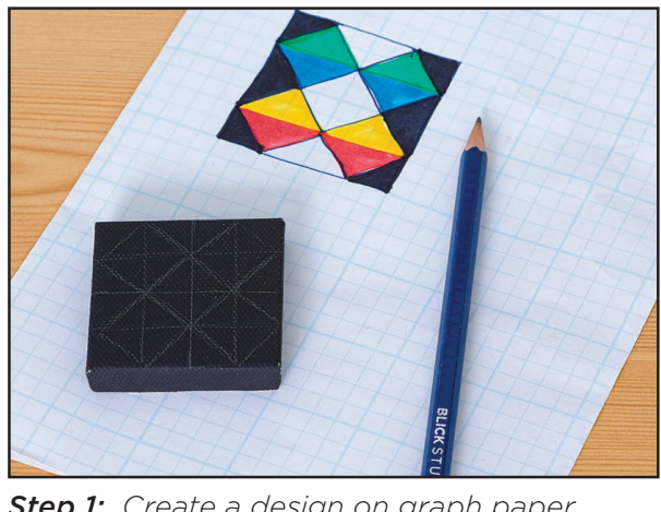
Step 1: Create a design on graph paper, then transfer it to mini canvas surface.

Anchor Standard 11: Relate artistic ideas and works with societal, cultural, and historical context to deepen understanding.