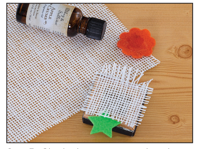
Step 3: Glue burlap or paper mesh to the back side to create a pouch. Insert a felt shape infused with aromatic oils and enjoy!