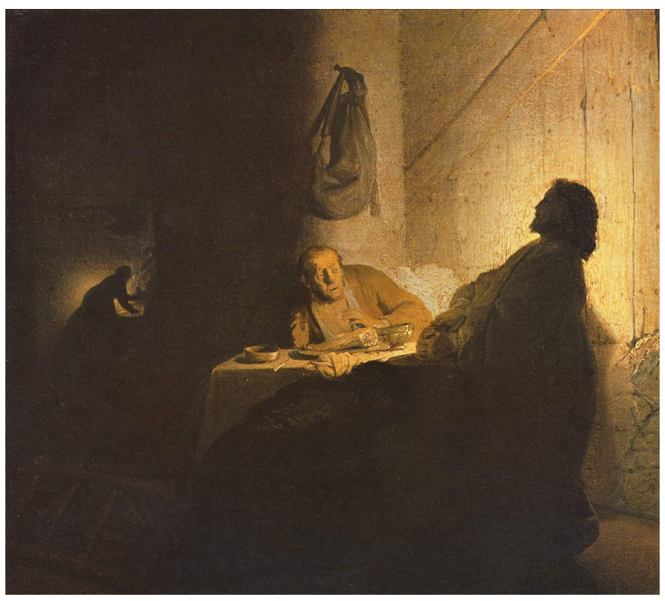
Painting by Rembrandt where strong dark-over-light value contrast is used to advance the foreground figure, while subtler differences in value are used in background figures

By reserving heavy application of white for passages of direct light, areas of the subject that are in direct light seem to advance. Reflected light can be made to recede visually by painting these passages more thinly.