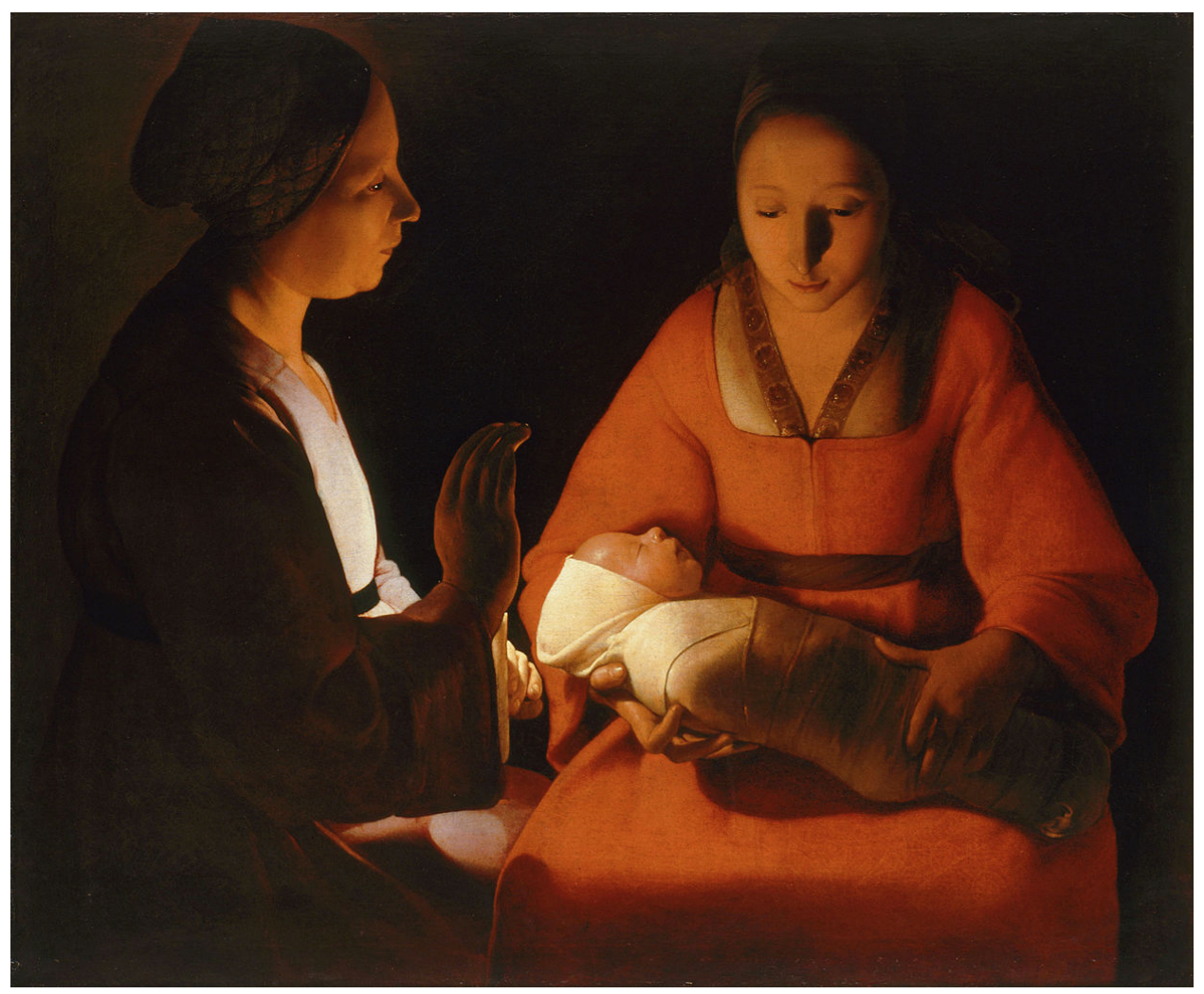
Georges de La Tour- "Newborn Infant" 1640s. Note the gradual transition from light to dark across round forms, and the extreme contrast of value where a light form overlaps a dark background.

Chiaroscuro originated as a concept in Renaissance art to describe the handling of light and dark contrasts. It continues as a fundamental concept in representational art, photography, and cinema, particularly where light and shadow are used to create a dramatic or theatrical effect.