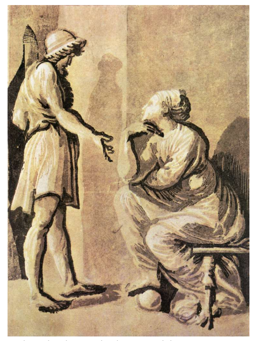
Early 16th c drawing by da Carpi exhibiting organization of values into light, midtones and darks

Chiaroscuro provides a way to organize values and contrasts and create focal points within a composition. In a preliminary drawing, this might involve reducing values to light, dark and midtones, or direct light, shadow and reflected light. The principle of chiaroscuro also involves organizing value contrasts from most extreme to most subtle. A strong value contrast doesn't require the lightest possible light to be placed against the darkest dark, but a composition organized by value contrast should have a passage where contrast is strongest between light and dark.