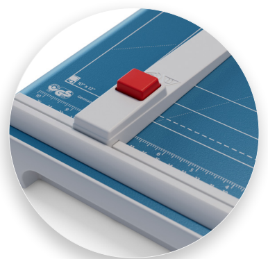
The adjustable alignment guide ensures accuracy during repetitive cuts.