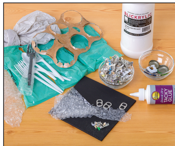
Step 1: Arrange found "trash" items on the canvas and glue them in place.

Anchor Standard 10: Synthesize and relate knowledge and personal experiences to make art.