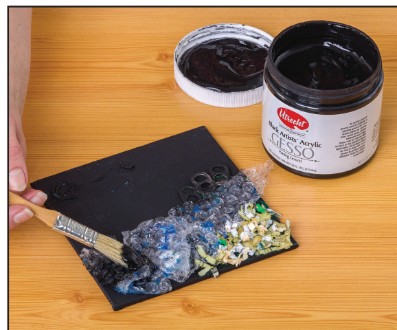
Step 2: Coat in the canvas black gesso, and cover all cracks and crevices in the added materials.