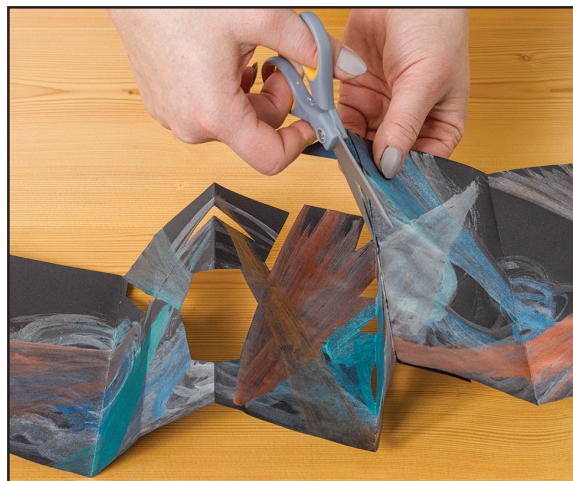
Step 3: To cut the pages, simply cut in from the folds.