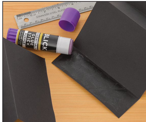
Step 1: Fold both sheets in an accordion style zig-zag pattern.

Anchor Standard 10: Synthesize and relate knowledge and personal experiences to make art.