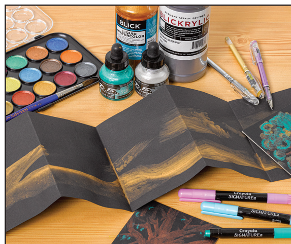
Step 2: Use metallic paints and Crayola Pearlescent Cream Sticks to Paint the pages and covers.