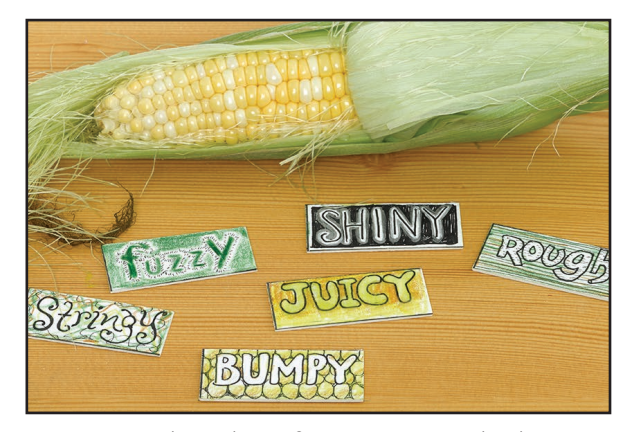
Step 2: Make a list of sensory words that describe the subject. Create text that visually represents the words.