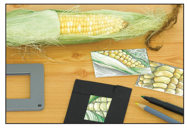
Step 1 : Make a viewfinder or use a cell phone camera to capture multiple, close-up views of chosen subject. Create sketches.

After completing steps 1-4, select one sketch and 1-2 sensory words. Create a painting from that sketch that also emphasizes the descriptive word. For example, build up textures to represent roughness or emphasize highlights to communicate shine.