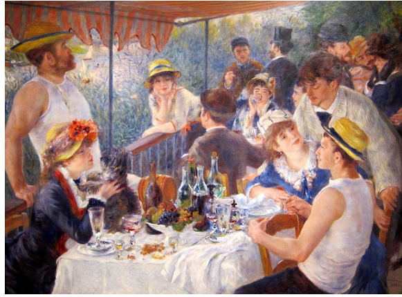
Painting by Renoir with strong value contrasts achieved by juxtaposing blue against white and yellow

A measure of skill is required to maintain balance between three colors with such variation in home value and maximum chroma. One strategy is to reduce overall contrast, to help place the primaries in a more similar light/dark range. Alternately, for a high contrast composition, directly juxtapose blues, reds and yellows against each other or against whites and blacks.