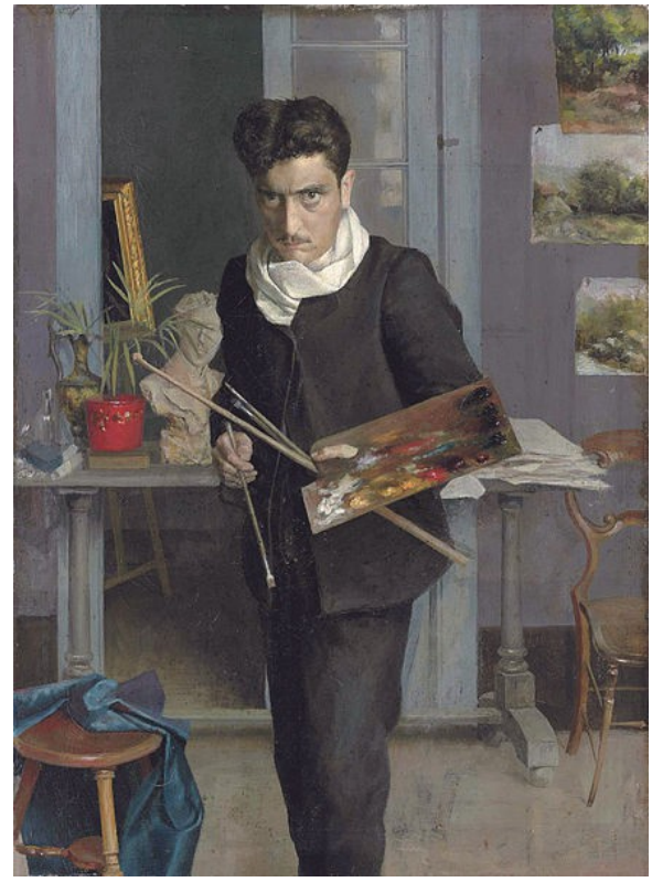
Self portrait by Julio Romero de Torres, using mid-value neutrals to reduce value contrast and emphasize intensity of color