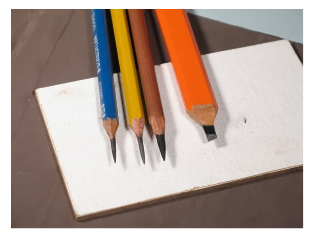
A proper drawing point should be conical and long enough to produce good line variation.