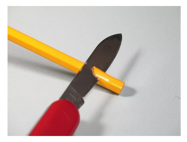
Begin with a sharp knife, removing wood to expose \frac{1}{2} to 1 inch of lead, depending on softness and thickness.