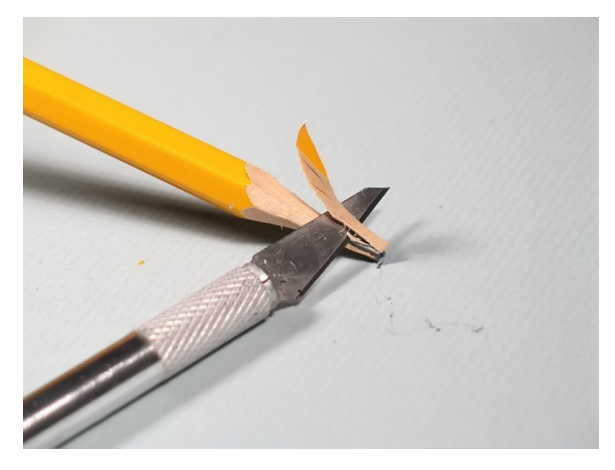
Any sharp knife will do; a #11 blade in a craft knife is ideal.