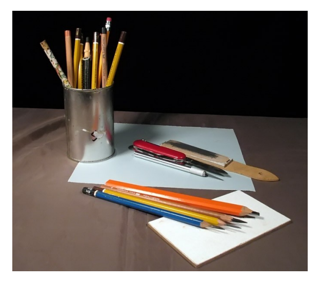
Mechanical pencil sharpeners are quick and convenient, but they produce a short point better for writing than drawing.

Mechanical and manual pencil sharpeners are quick and convenient, but sharpening by hand is the best way to achieve a versatile point.