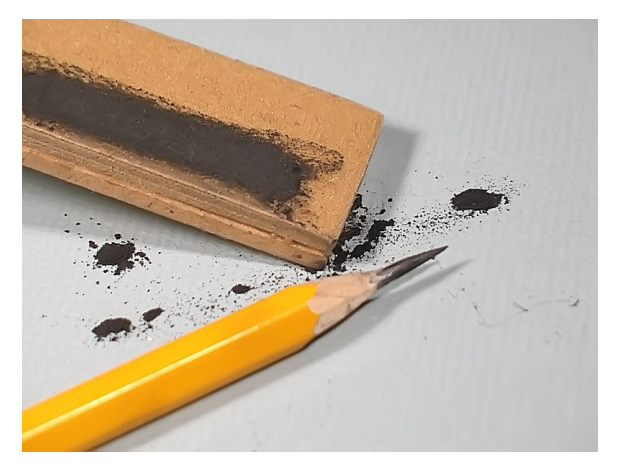
Push lead forward across sanding surface, rolling the pencil to ensure a uniform shape.

Use a sanding paddle or small piece of sandpaper over a stiff card to shape lead.