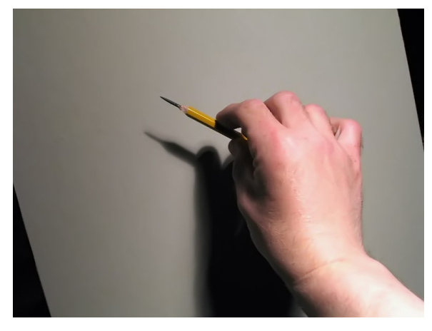
A drawing instrument should be held loosely between the fingers and thumb- <u>not</u> tightly like a writing pencil. This grip facilitates fluid ellipses, long, straight strokes and careful detail without excessive pressure on the paper.