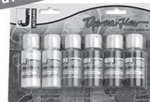
JAC9923 - 6 Color Set (6 - 1 fl oz/29 ml flip-top bottles)