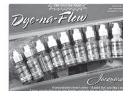
JAC9908 -Exciter Pack (9 - 1/2 fl oz/14 ml bottles)