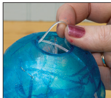
Step 5: Attach a string through top of the dome for hanging.