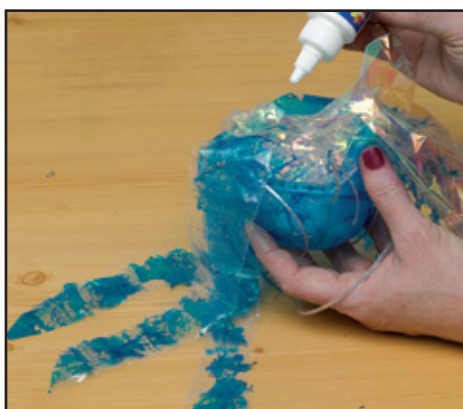
Step 4: Tear plastic sheet into strips and glue inside the dome for arms. Glue iridescent film inside the dome to create the jellie's mouth.