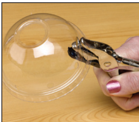
Step 1: Gather recycled plastic dome lids and punch holes around their edges.