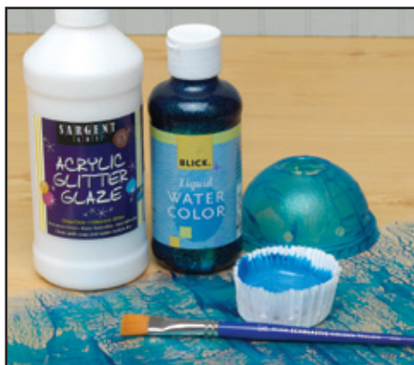
Step 2: Paint the plastic dome with a mixture of Glitter Glaze and Liquid Watercolor. Allow to dry.