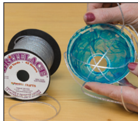
Step 3: Thread BrightLace through the punched holes on dome lid for tentacles.