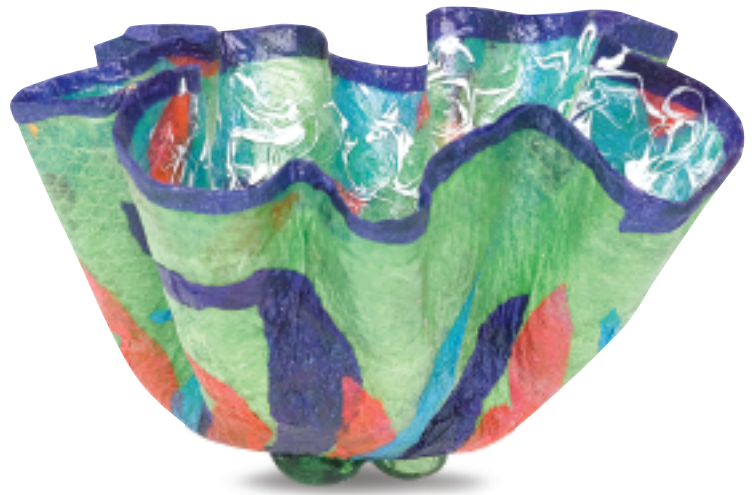
Gel-ly Bowl formed with Blick Tissue Paper collage, Golden Fluid Acrylic paint and glass globs for feet