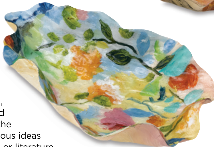
Left: Gel-ly Bowl formed and painted with Golden Fluid Acrylic Colors