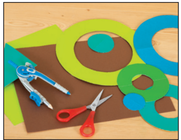
Step 1: Cut concentric circles from double color cardstock to form rings.

9-12 Students differentiate among a variety of historical and cultural contexts in terms of characteristics and purposes of works of art