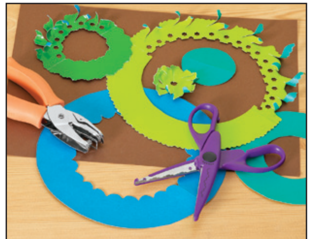
Step 2: Cut designs from the edges of each ring. Fold, bend, or curl to create dimension.