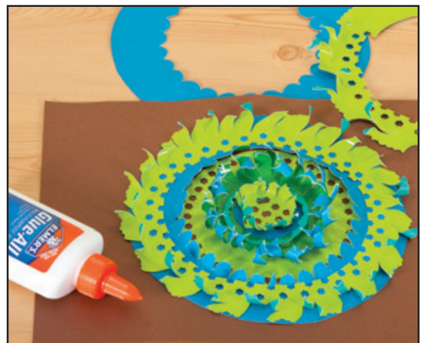
Step 3: Glue rings together on a construction paper background.