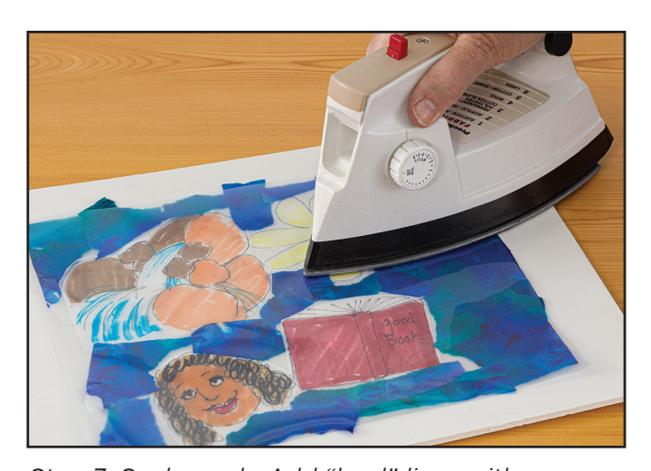
Step 3: Seal pouch. Add "lead" lines with permanent black marker.