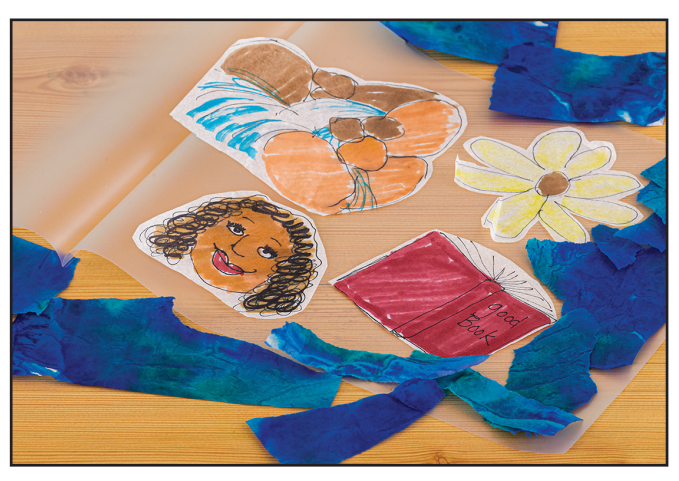
Step 2: Create images symbolizing peace and cut them out. Glue images inside pouch and arrange background pieces around them.