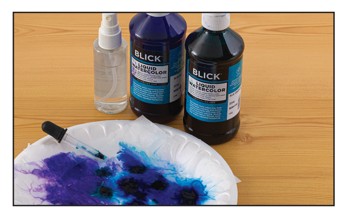
Step 1: Using a dropper and liquid watercolor, "stain" a stack of tissue to be used for the background.

Anchor Standard 9.1: Apply criteria to evaluate artistic work.