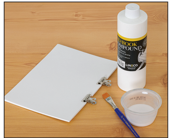
Step 2: Use book compound to secure new pages together.