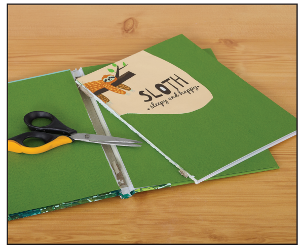
Step 1: Cut end pages to remove book insert.

Anchor Standard 10: Synthesize and relate knowledge and personal experiences to make art.