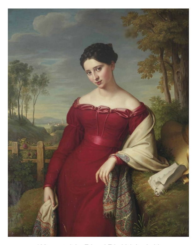
1824 portrait by Eduard Friedrich Leybold

Mixing fugitive colors directly with white to produce tints will speed up fading compared to using it full strength or in glazing over mid-tones and darks. Paintings displayed in full sun or under unshielded halogen lamps can fade more quickly than if they are protected from harsh UV light.