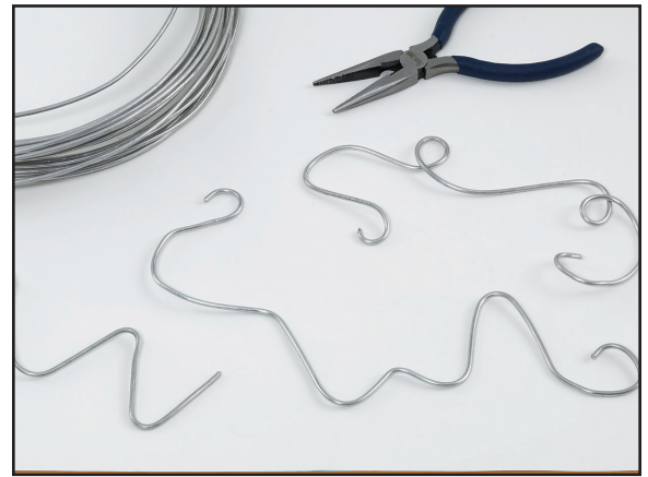
Step 1: Bend sections of wire into expressive lines featuring curves, loops, and/or angles.

Rice paper has a natural starch that will stiffen when dry, so it's okay for it to sag and fit a little loosely over the wire — it will firm up.