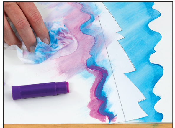
Step 3: Use a wet wipe to move color from stencil to paper. Repeat over and over, moving stencil each time, to create new patterns and colors..