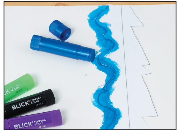
Step 2: Apply color from tempera stick onto and around stencil edge.