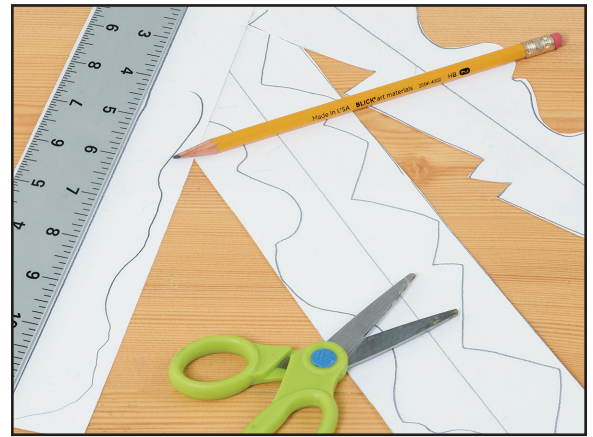
Step 1: Create a stencil by drawing lines and cutting edges.

Anchor Standard 3: Refine and complete artistic work.