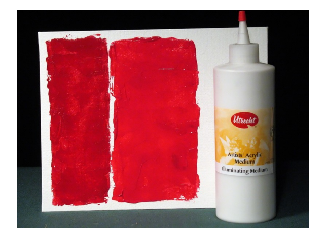
Boost in apparent intensity is permanent in the dry film.

Left: Quinacridone Red applied undiluted Right: Quinacridone Red with the addition of Illuminating Medium