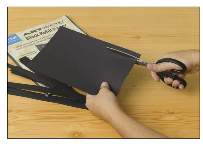
Step 1: Cut strips of black paper, 1/2" or wider, across the long edge of the sheet.

communication of their ideas relates to the media, techniques, and processes they use