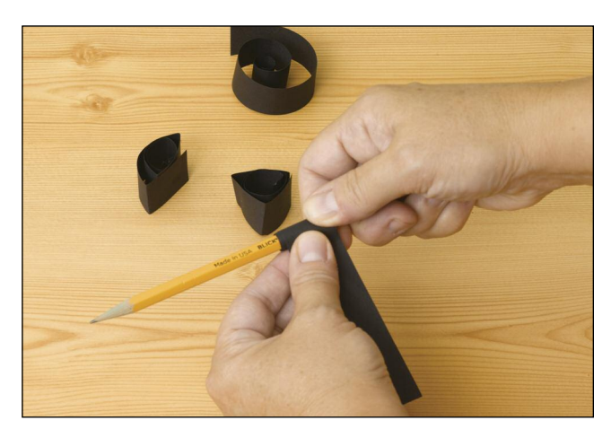
Step 2: Wrap strips of black paper around various quilling "tools". Experiment with shapes by pinching edges.